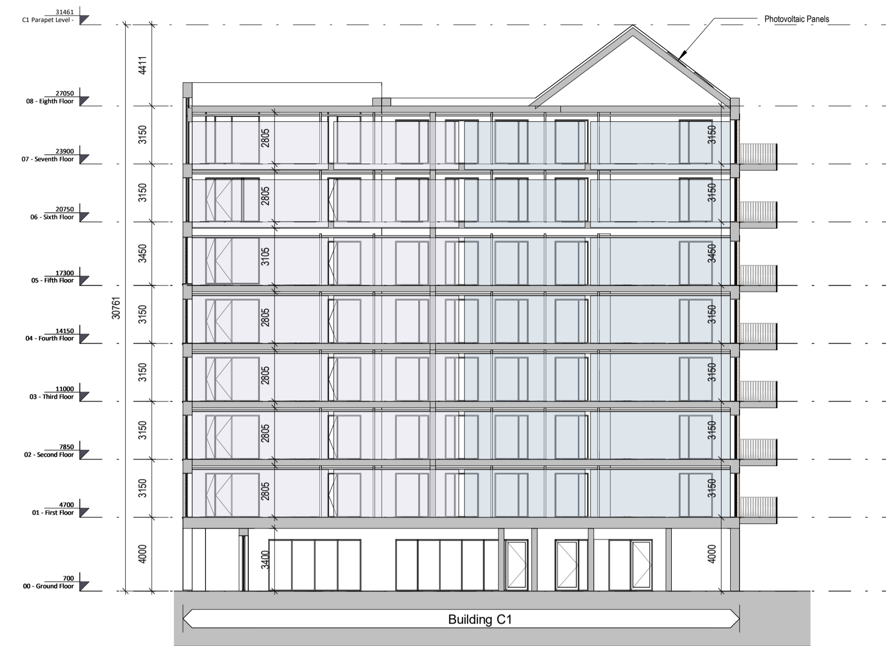
2 C1 Section B-B 1:200