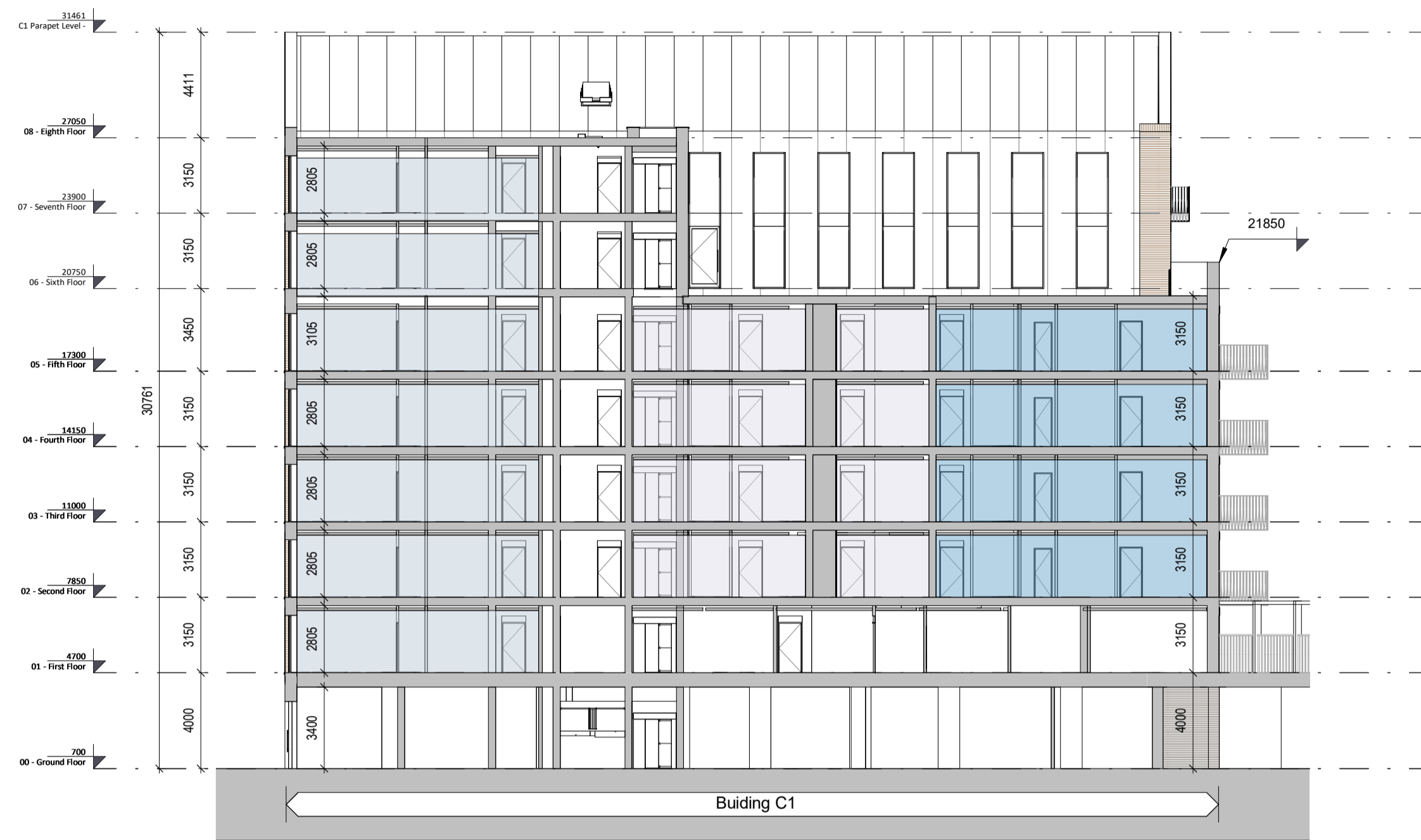
1 C1 Section A-A 1:200